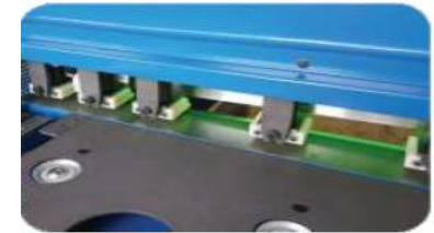
Specially-designed rectangular hold downs, suitable for cutting narrow stripes (optional)