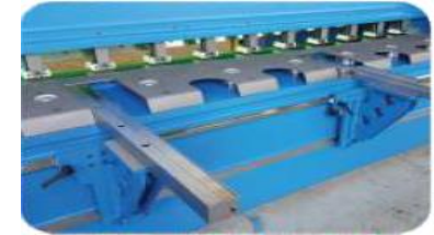
Movable Front Supports (optional)