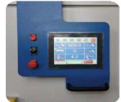
Colour Touch Screen 10,4", movable along machine's length (optional)